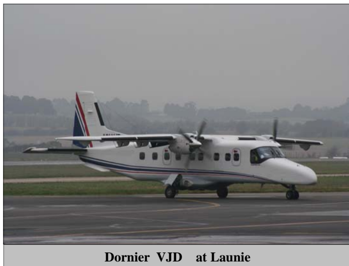
Dornier VJD at Launie