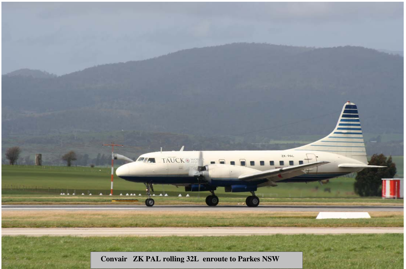
Convair ZK PAL rolling 32L enroute to Parkes NSW

Its all the old "been there, done it and we will do it all over again"