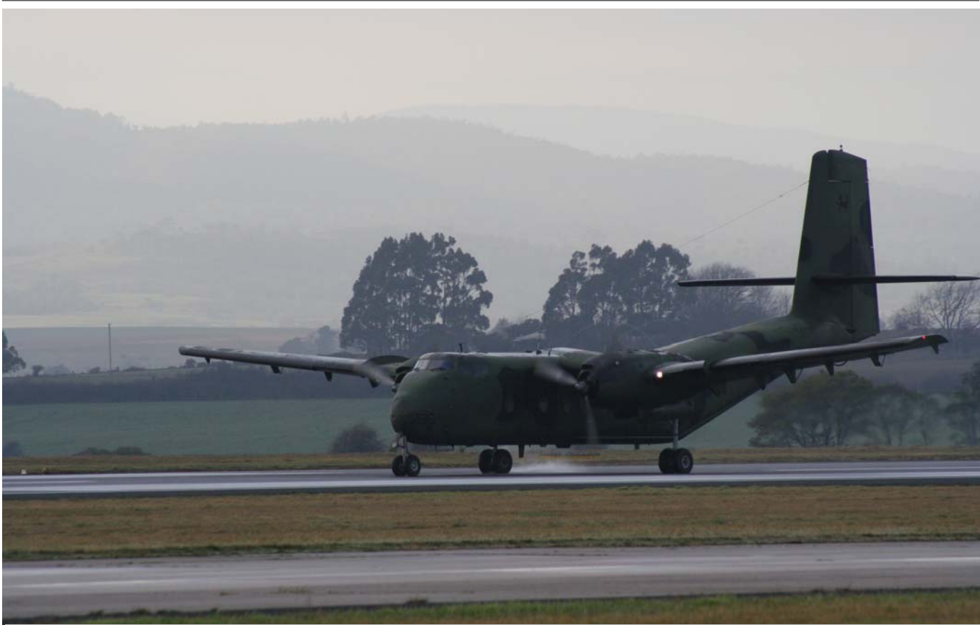
38 Squadron Caribou departing for Townsville after a week in Launie

If undelivered return to Tasmanian Aero Club P.O. Box 63 Evandale 7212 Tas.