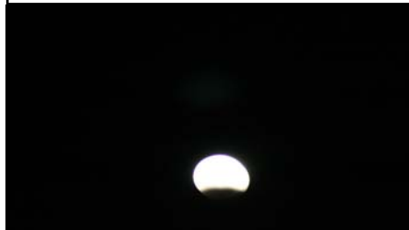
Eclip over Launceston taken from Prospect