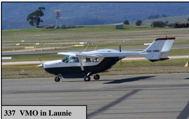
337 VMO in Launie